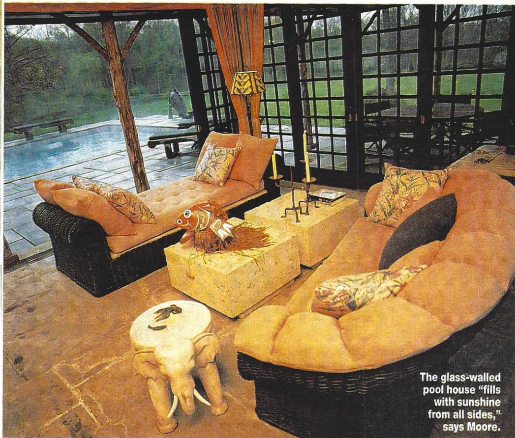
The glass-walled pool house "fills with sunshine from all sides," says Moore.