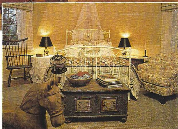
Above: A welcoming bedroom, complete with draped bed and antique candlesticks, makes guests—like best buddy Bernadette Peters—feel right at home.

(continued from p. 36) meadows and streams.